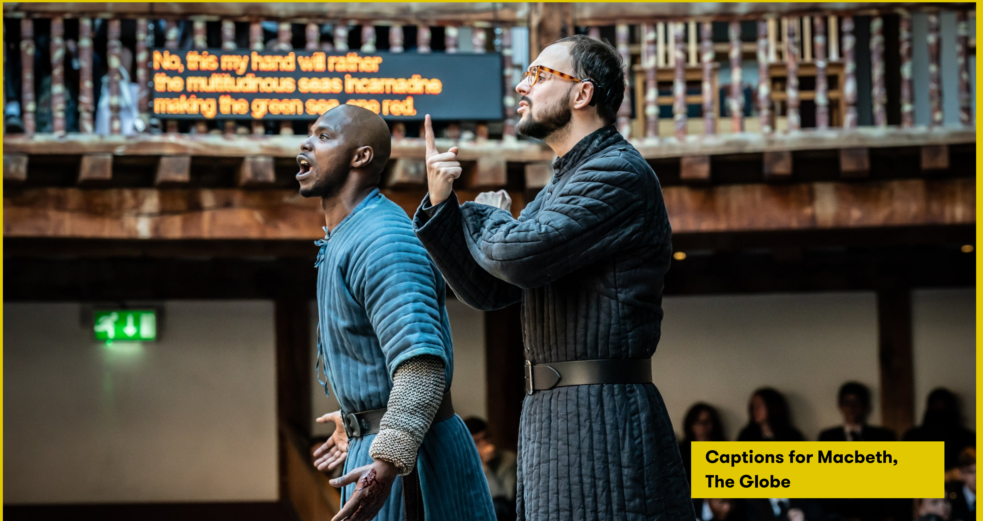
Captions for Macbeth, The Globe